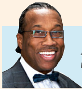
A message from the founder ...